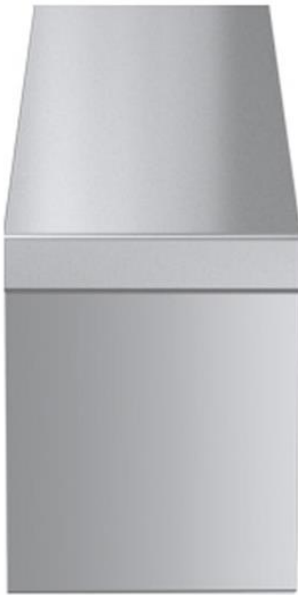
589152 (MCNABABOOO) Closed Work Top, one-side operated